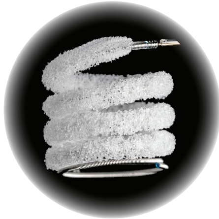
Self-expands on contact with blood

Porous embolic scaffold supports rapid formation of small interconnected clots