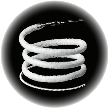
Crimped for catheter delivery